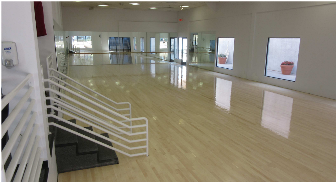
Our Brand New Floor at Oasis